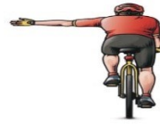
Left Turn Extend your left arm out straight from your side.